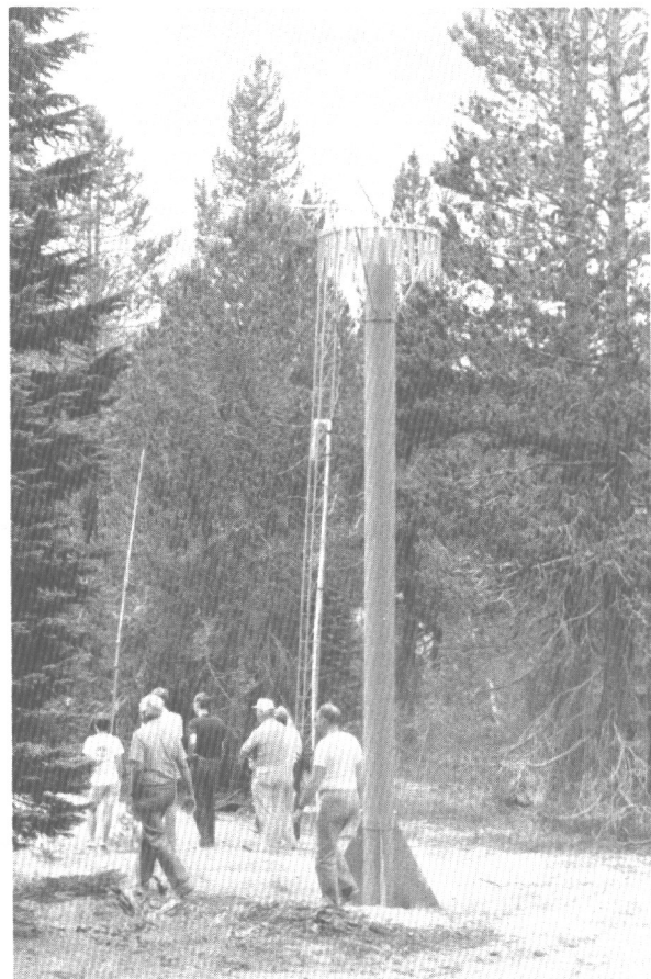
A telemetered precipitation gauge with a windshield. This gauge is part of the SNOTEL network, and is located about 9000 feet above sea level on a pass between Lake Tahoe and Reno.