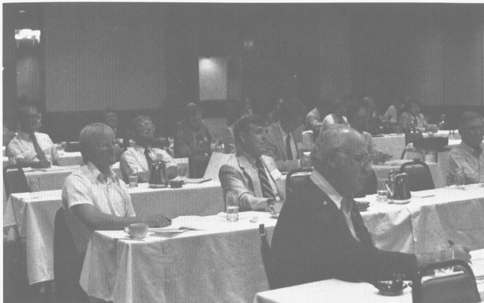
Some of the attendees of the 1985 AASC Meeting held in the Nugget Hotel in Reno, Nevada.