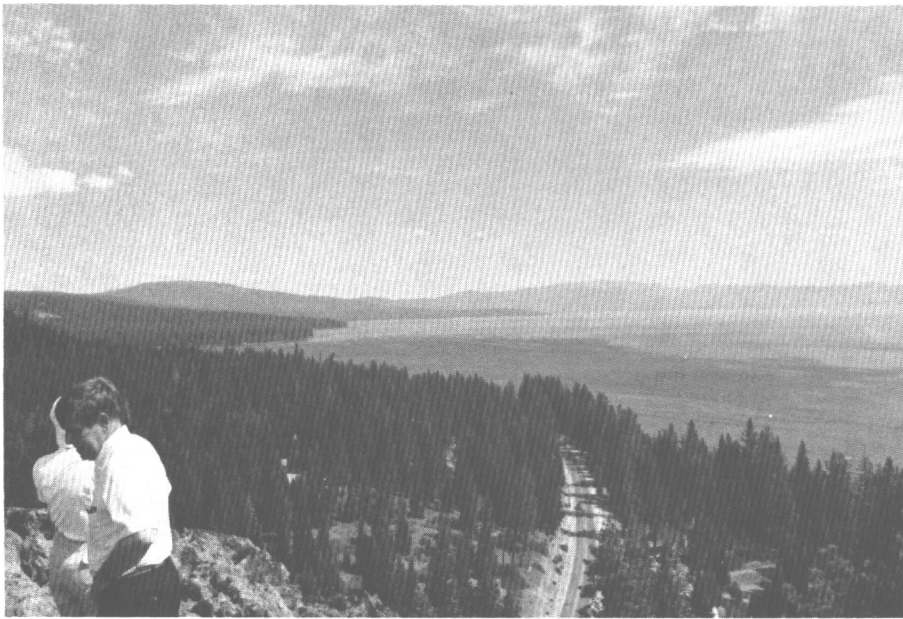
From the top of Eagle Rock each of the hikers was presented a spectacular view NNE over Lake Tahoe.